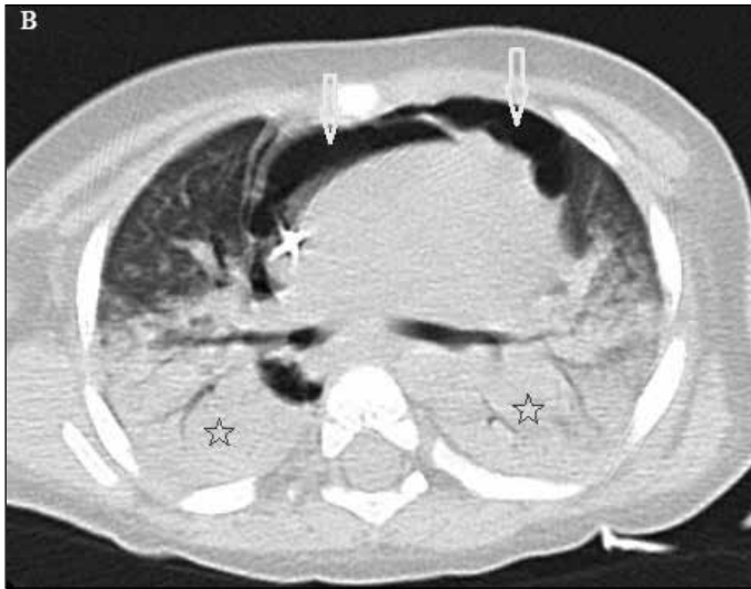
Figure 2. Thorax computed tomography. Pneumomediastinum (arrows) and bilateral basal lung infiltrates (stars).