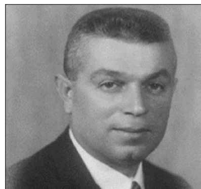
Figure 1. Dr. Behçet Uz. 1

In this process, he witnessed the proclamation of the Constitutional Monarchy on July 23, 1908, welcomed with interest the reinstatement of the first Ottoman constitution, the Kanun-u Esasi, on July 23, 1908, after 30 years of suspension,