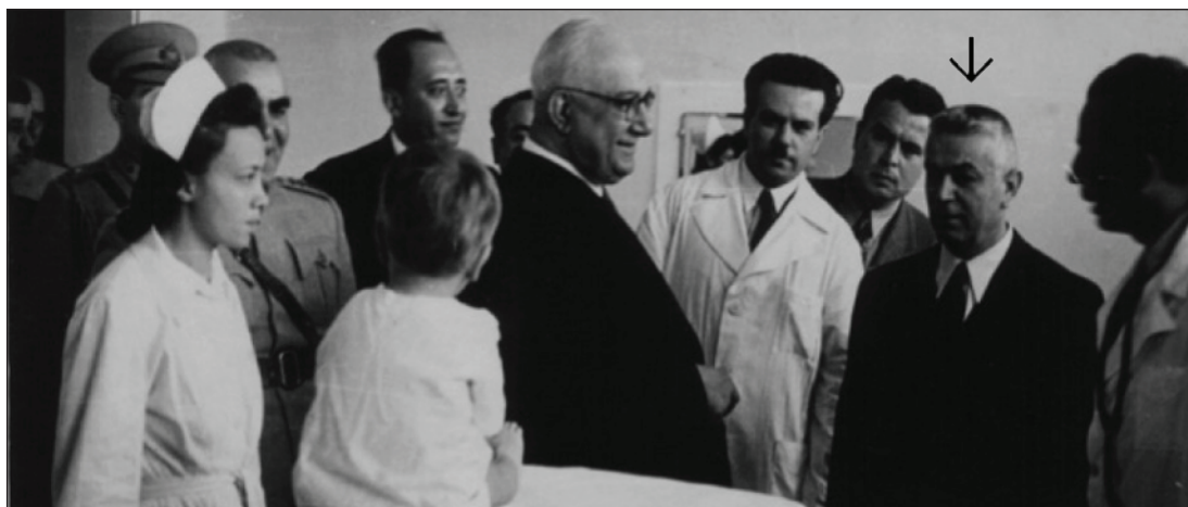
Figure 2. Dr. Behçet Uz with Prime Minister Recep Peker at the opening of the hospital named after him (2 April 1947) (3).